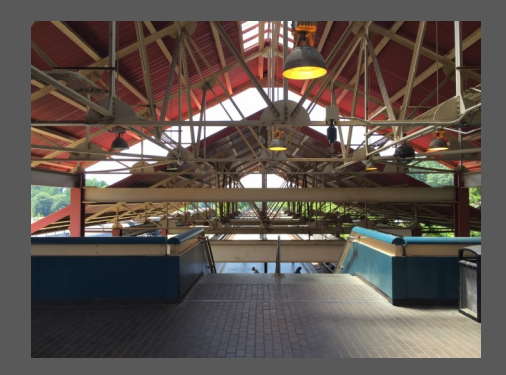
Inside the station